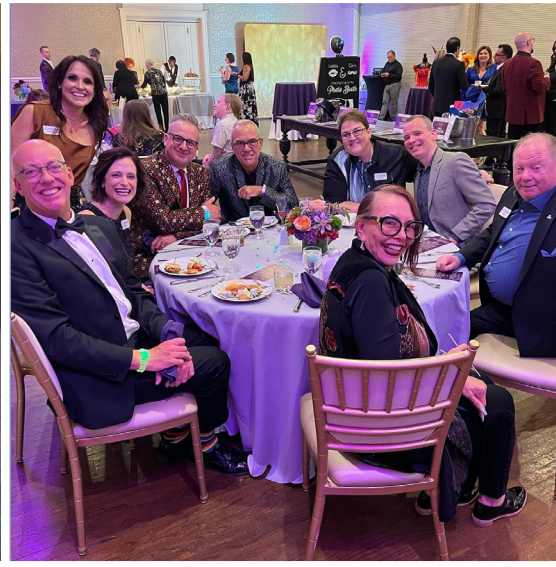
2022 BROADWAY BASH!