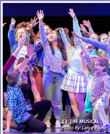
13: THE MUSICAL