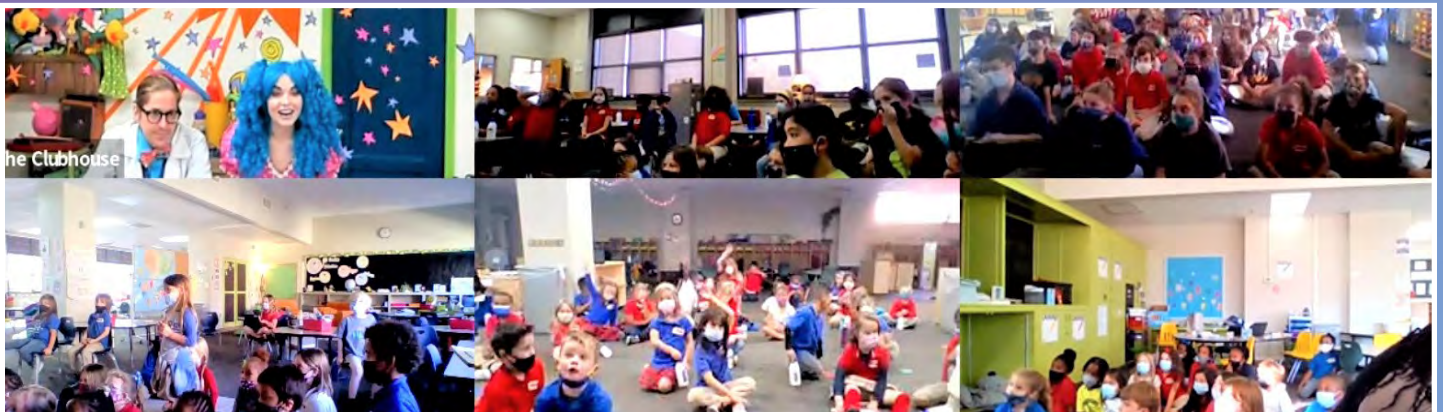
Virtual Zoom Appearance with 5 Classrooms at Once!