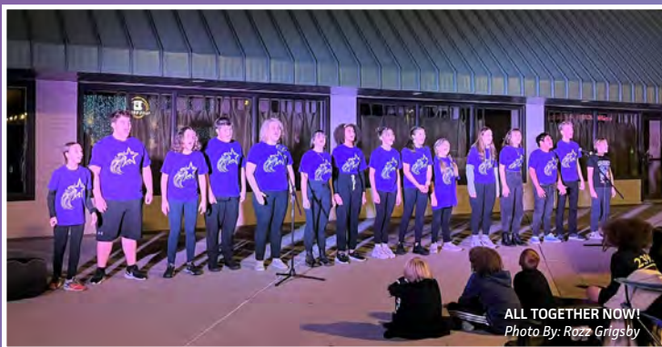
ALL TOGETHER NOW!