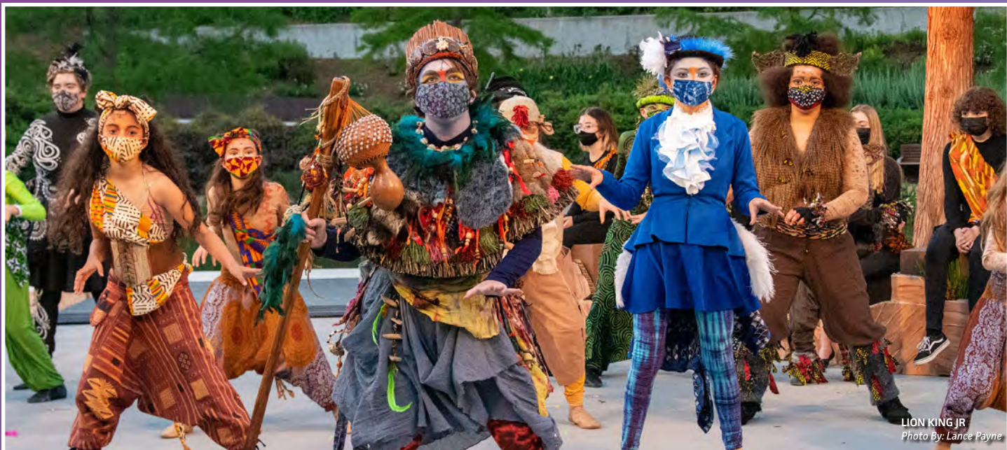
LION KING JR