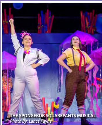
THE SPONGEBOB SQUAREPANTS MUSICAL