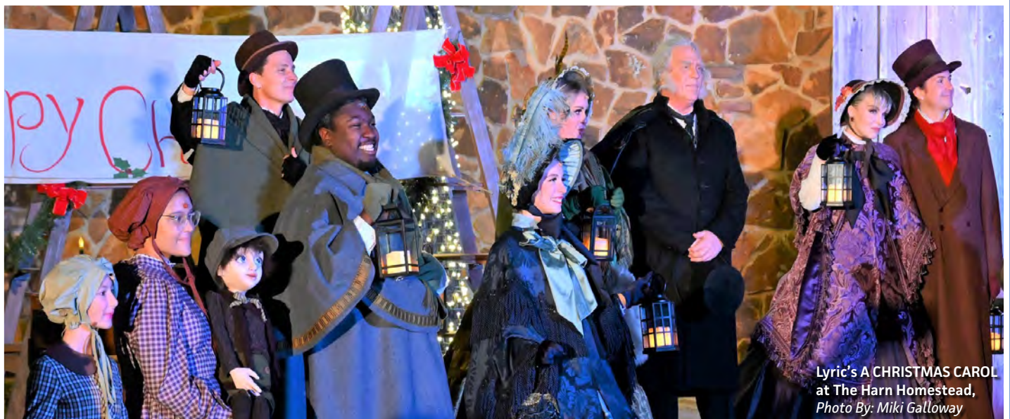
Lyric's A CHRISTMAS CAROL at The Harn Homestead