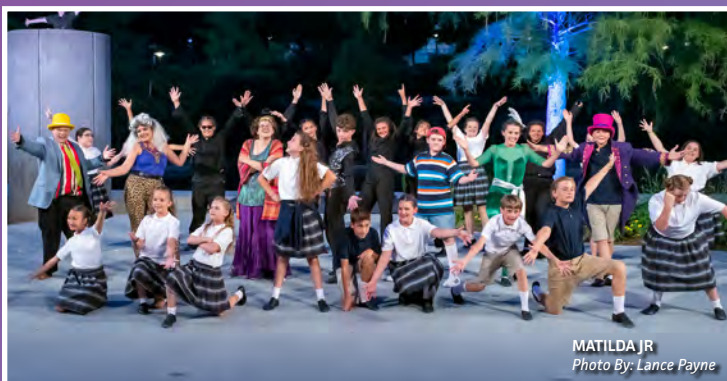
MATILDA JR