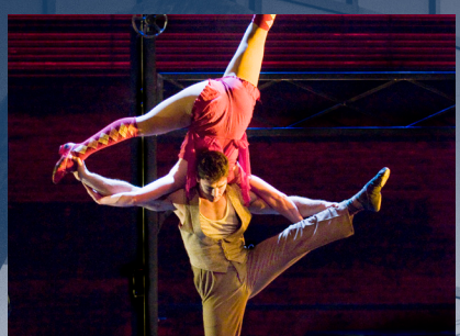
CIRQUE MECHANICS -Birdhouse Factory SATURDAY, NOVEMBER 20 • 8:00 PM