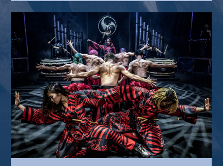
DRUM TAO TUESDAY, MARCH 22 • 7:30 PM