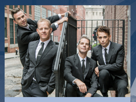
THE MIDTOWN MEN - STARS FROM THE ORIGINAL BROADWAY CAST OF JERSEY BOYS* FRIDAY, OCTOBER 29 • 8:00 PM