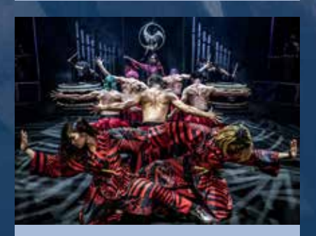
DRUM TAO TUESDAY, MARCH 22 • 7:30 PM