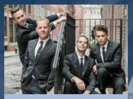
THE MIDTOWN MEN - STARS FROM THE ORIGINAL BROADWAY CAST OF JERSEY BOYS* FRIDAY, OCTOBER 29 • 8:00 PM