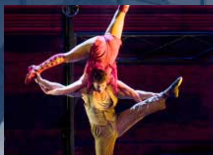
CIRQUE MECHANICS -Birdhouse Factory SATURDAY, NOVEMBER 20 • 8:00 PM